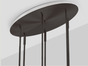
CIRCULAR FIXED SWIVEL CANOPY CAN.VC.CIR.SW.X-XXX Ø600 X 37MM / 23.6" X 1.5" DRIVER HOUSED IN CANOPY