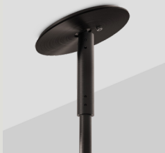
SLIM Ø14MM FIXED SWIVEL CANOPY CAN.SL.F14.SW.X-XXX Ø120 X 7MM / 4.7" X 0.3" DRIVER HOUSED IN CEILING