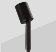
PUCK Ø14MM FIXED SWIVEL CANOPY CAN.PK.F14.SW.X-XXX Ø50 X 65MM / 2" X 2.6" DRIVER HOUSED IN CEILING