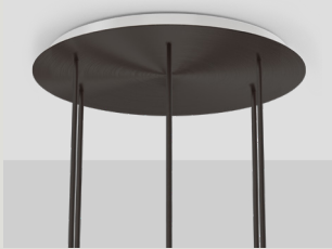
CIRCULAR FIXED CANOPY CAN.VC.CIR.X-XXX Ø600 X 37MM / 23.6" X 1.5" DRIVER HOUSED IN CANOPY

ALL ROSS GARDAM CEILING MOUNTED FIXTURES COME SUPPLIED WITH A CEILING CANOPY UNLESS OTHERWISE SPECIFIED. EACH CANOPY INCLUDES ELECTRICAL CONNECTORS, EARTH WIRE AND CABLE RETENTION TO CONNECT TO MAINS POWER. THE BELOW IMAGES DEPICT THE CEILING CANOPIES AVAILABLE WITH EACH FIXTURE TYPE. IF NO CANOPY IS SELECTED THE CIRCULAR CANOPY WILL BE SUPPLIED.