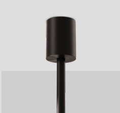
PUCK Ø14MM FIXED CANOPY CAN.PK.F14.X-XXX Ø50 X 65MM / 2" X 2.6" DRIVER HOUSED IN CEILING