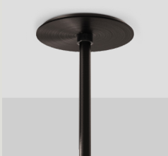
SLIM Ø14MM FIXED CANOPY CAN.SL.F14.X-XXX Ø120 X 7MM / 4.7" X 0.3" DRIVER HOUSED IN CEILING