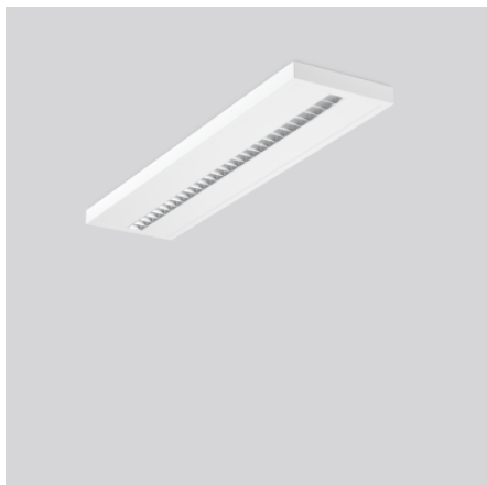
Ceiling luminaires 4051859448280 L 1202, B 302, H 47