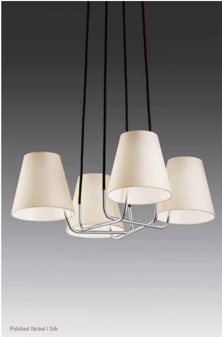
Polished Nickel | Silk