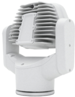
SL1 Searchlight, white housing, backside