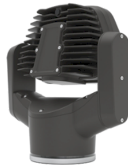
SL1 Searchlight, black housing, backside