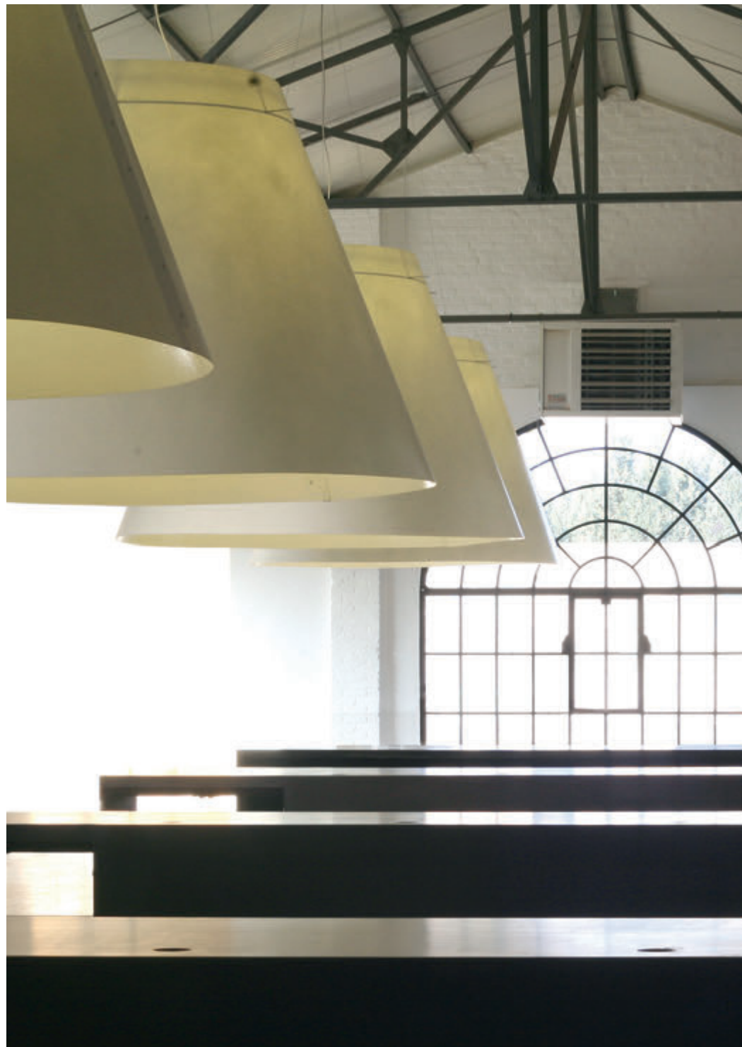
Office Nulens, Belgium - architect Lens o ass