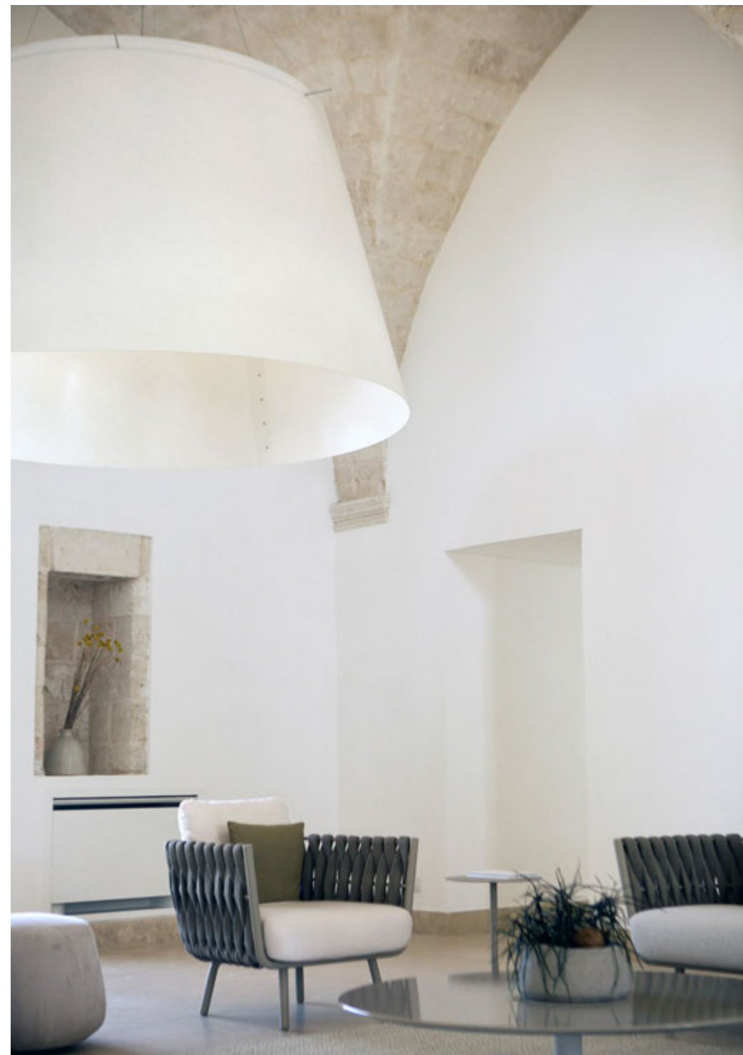
Masseria Antonio Augusto, Leverano, Italy