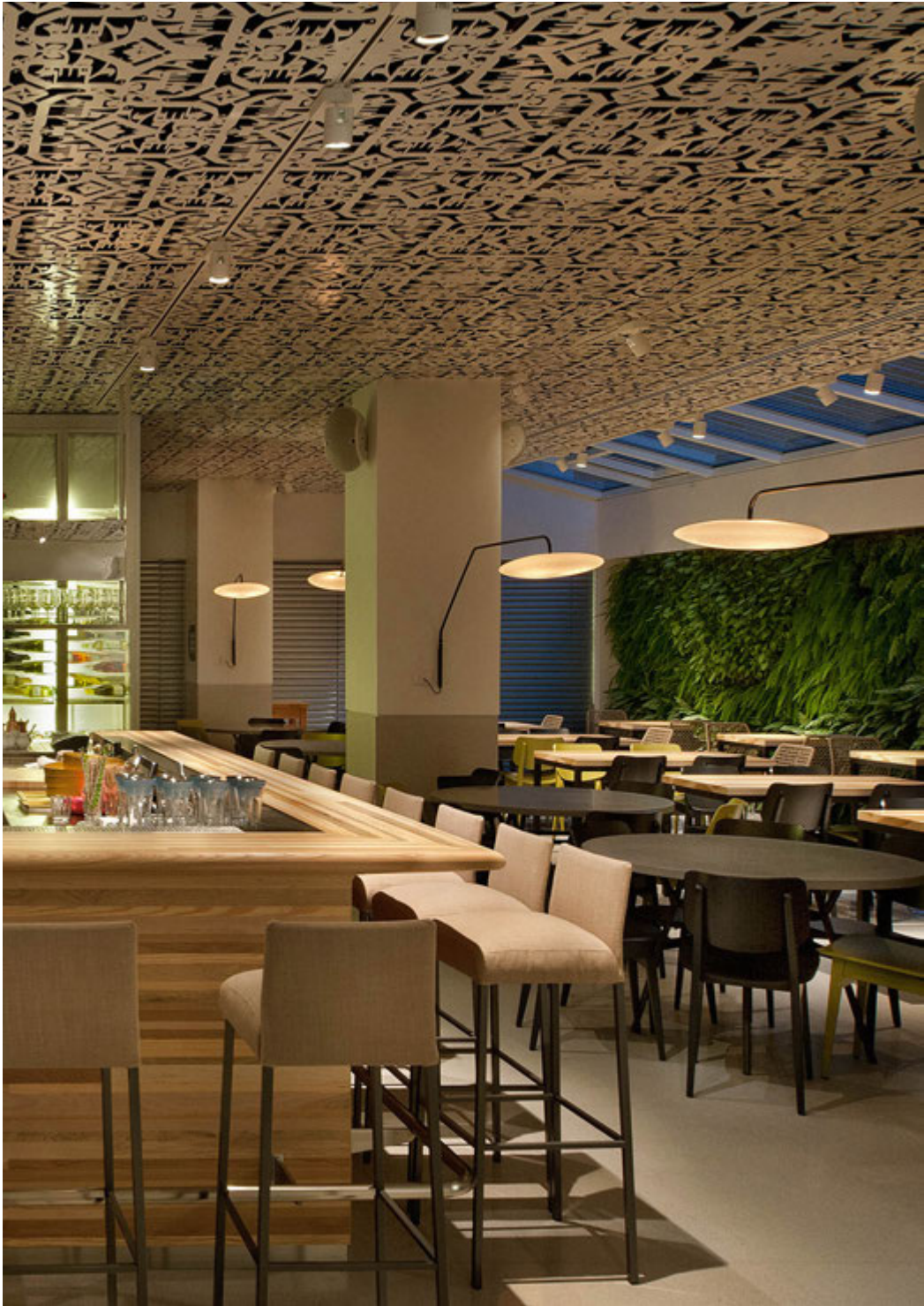
°fool moon wall 1 / Mendeli Street Hotel, Tel-Aviv - ST-OR - lighting designer Ailon Gavish, Studio Twilight