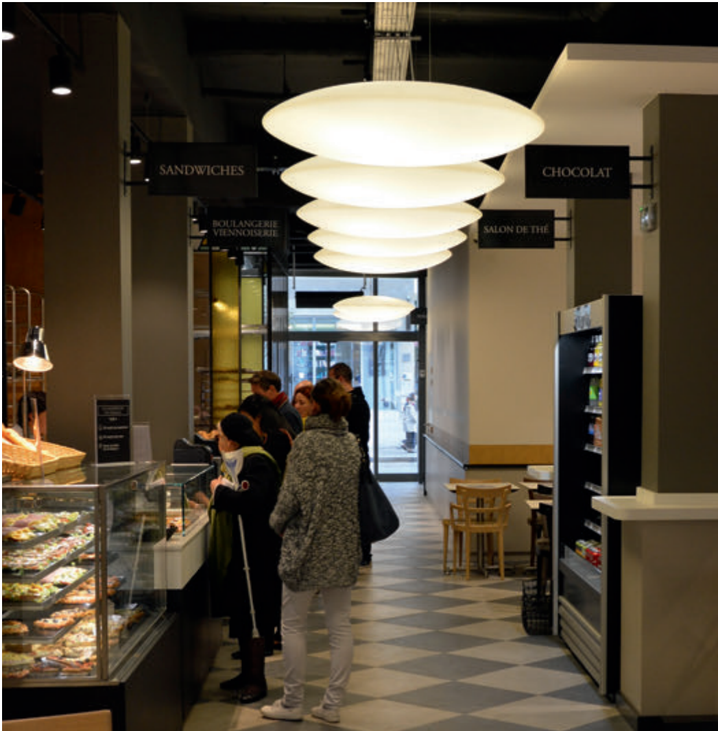
°fool moon medium / Maison Bettant, Lyon - architect Mona LISA - Christophe Millet - light design Inédit