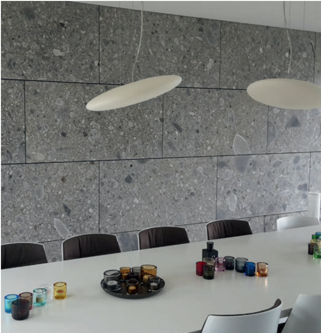
°fool moon small / Villa Brockmans - D&A Architecten