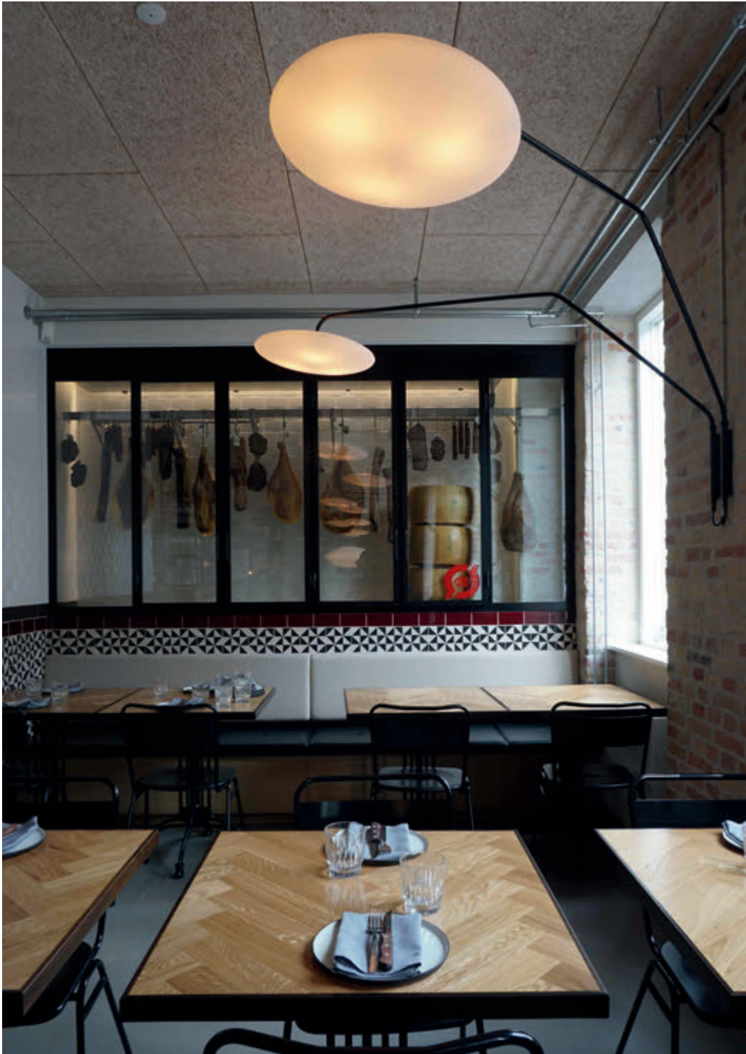
°fool moon wall 1 / Christian Puglisi's restaurant BÆST, Copenhagen - architect Fobsi Studio