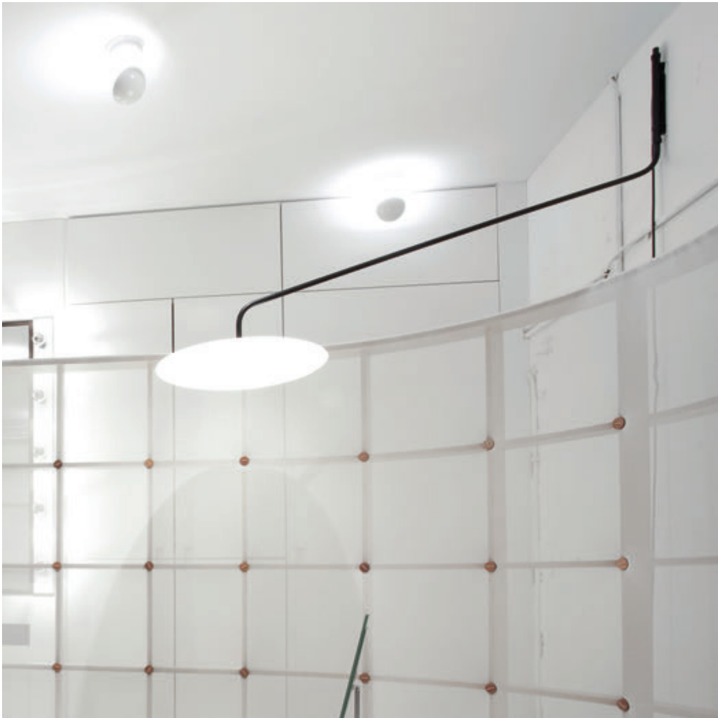
°fool moon wall 2 / Depoortere, Hasselt - architect Lens°ass