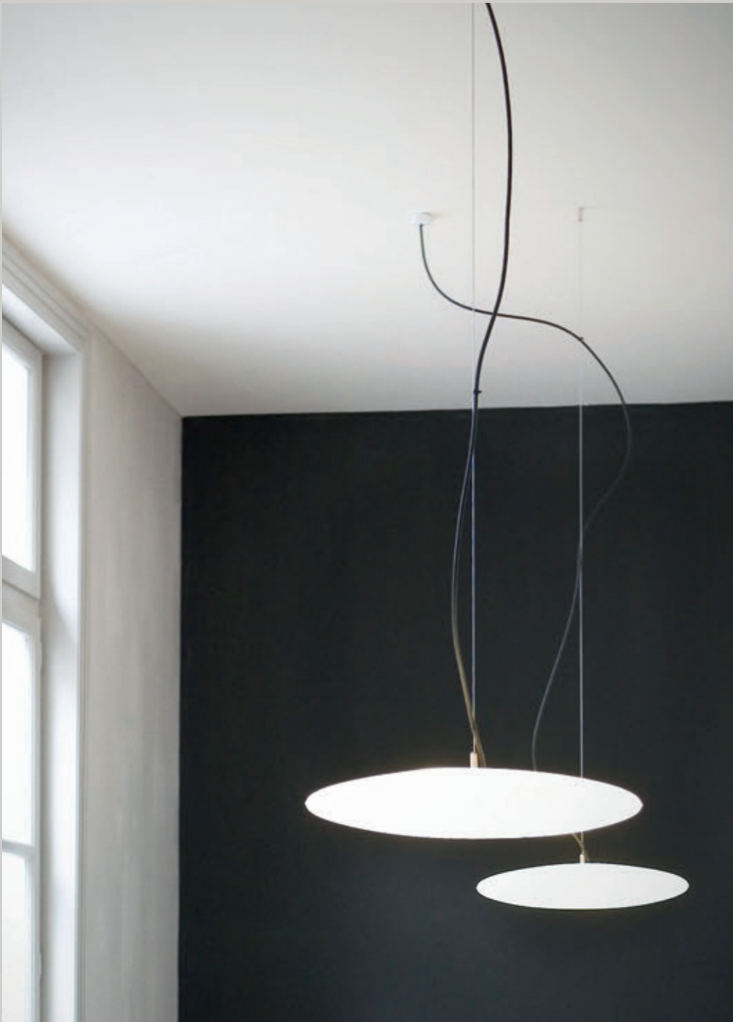
°fool moon small / Dell’anno - architect Lens°ass