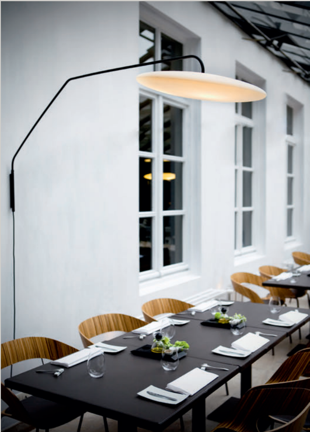
°fool moon wall 1 / Dell'anno - architect Lens°ass