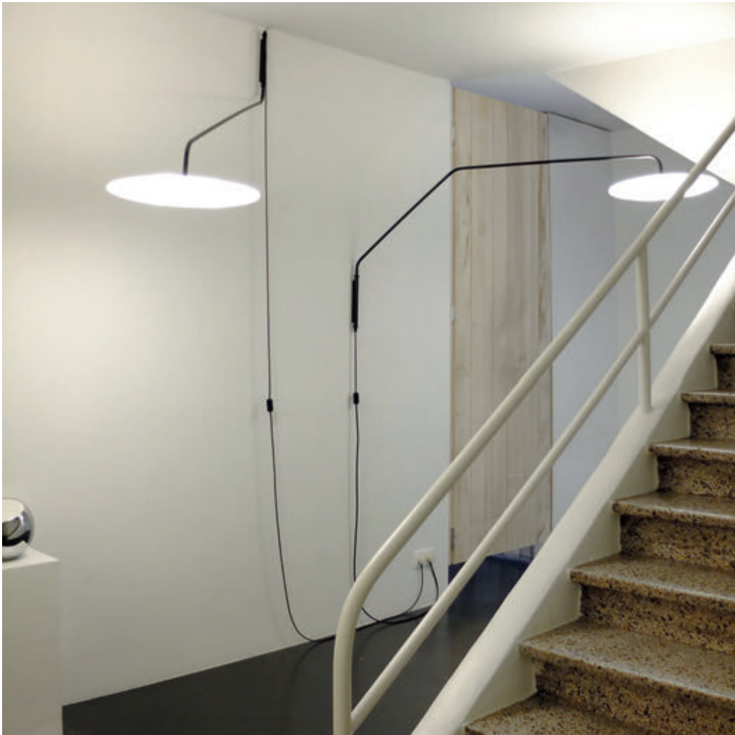
°fool moon wall 1 & 2 / Office hall, Hasselt - architect Lens°ass