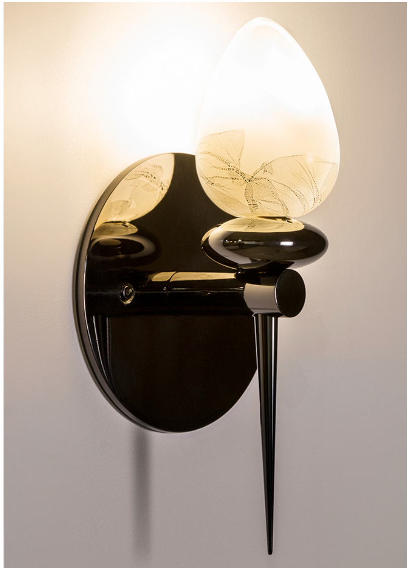
Shown in Polished Black metal, and Opal White glass with silver leaf base