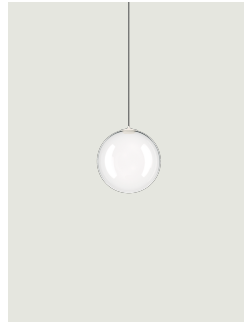
Random Solo 12