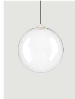
Random Solo 28