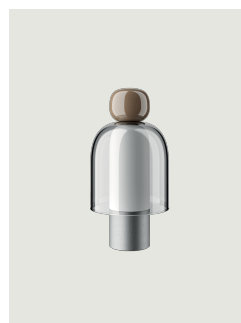
Easy Peasy Chestnut