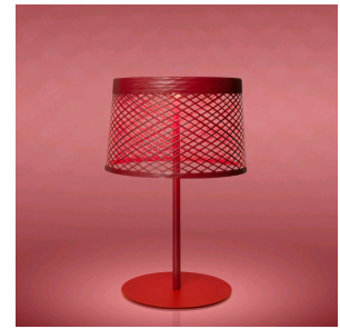
Twiggy Grid XL