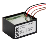
Code: 106 Supported n. of lamps: 1 Power supply dual function Vout 24Vdc: 8W/100÷240V Iout 350mA: 6X1W/100÷240V - IP65 CLASS II SELV EQ.