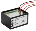
Code: 106 Supported n. of lamps: 1 Power supply dual function Vout 24Vdc: 8W/100÷240V Iout 350mA: 6X1W/100÷240V - IP65 CLASS II SELV EQ.