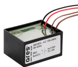
Code: 106 Supported n. of lamps: 1 Power supply dual function Vout 24Vdc: 8W/100÷240V Iout 350mA: 6X1W/100÷240V - IP65 CLASS II SELV EQ.