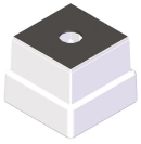
Code: 151 Box for installation 120 x 120 x H 95 mm