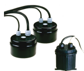
Code: 17 Transformer 200W 230V/12V 50Hz IP 66