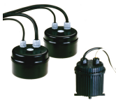
Code: 17 Transformer 200W 230V/12V 50Hz IP 66