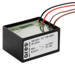
Code: 106 Power supply dual function Vout 24Vdc: 8W/100÷240V Iout 350mA: 6X1W/100÷240V - IP65 CLASS II SELV EQ.