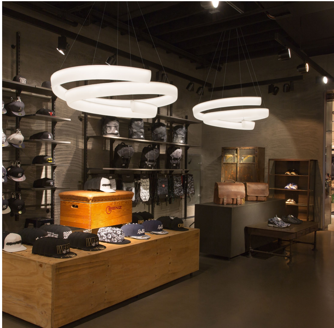
INFECTED CONCEPT STORE GRAZ | AUSTRIA