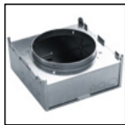
S.7329 HOUSING FOR CONCRETE CEILINGS Dim. 260 x 260 x 150mm