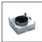
S.7309 HOUSING FOR CONCRETE CEILINGS Dim. 200 x 200 x 120mm