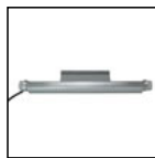
S.5901 WALL BRACKET For wall applications