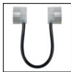
S.3408 END CAP WITH SUPPLY CABLE Silicone end cap with piece of cable to supply the following fitting with parallel connection.