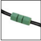
FAST CONNECTOR INCLUDED