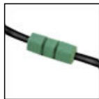
FAST CONNECTOR INCLUDED