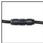
FAST CONNECTOR INCLUDED