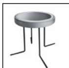
S.5350 FLANGE FOR BOLLARD Ø 240 mm flange to be fixed in concrete with stainless steel screws for fixing in the ground.