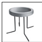
S.5350 FLANGE FOR BOLLARD Ø 240 mm flange to be fixed in concrete with stainless steel screws for fixing in the ground.