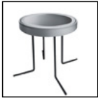
S.5350 FLANGE FOR BOLLARD Ø 240 mm flange to be fixed in concrete with stainless steel screws for fixing in the ground.