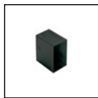
S.4623 RECESSING BOX RECTANGULAR 145x90 mm. Width 140 mm.