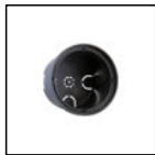
S.4612 RECESSING BOX Dimensions Ø 98 mm Width 95 mm