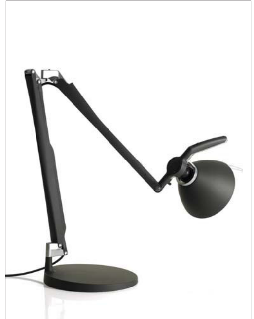
D33N.100 on/off switch