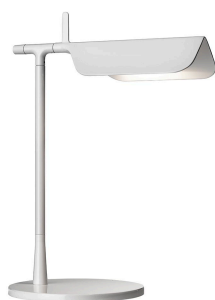
Table lamp. Body in painted pressofused aluminium. Multi-led diffuser in specially designed PMMA to avoid the Multi Shadow effect and dazzle. Head rotation \pm 45^\circ .