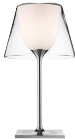
Table luminaire providing diffused lighting. Base, rod support and diffuser support in die-cast, polished Zamak alloy. Polished aluminum tubular. Injection-molded, matte black PA (Nylon) base cover. Injection-molded PC (polycarbonate) opal inner diffuser. Outer diffuser in transparent glass