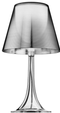
Table lamp providing diffused light. Fully transparent, injection-molded PMMA polymethylmethacrylate frame; opaline, injection-molded polycarbonate internal diffuser and injectionmolded transparent or colored polycarbonate external diffuser completely finished with high-vacuum aluminization process.