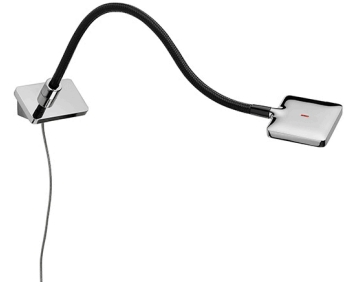
Minikelvin Wall Flex designed by Antonio Citterio

Diffuse illumination lighting device for wall mounting. Wall attachment in die-cast aluminium. The adaptor is on the plug and the useful cable length is 200 cm. ON/OFF switch with Soft Touch technology and light flow adjustment to 2 intensities (100% - 50% - 0%).