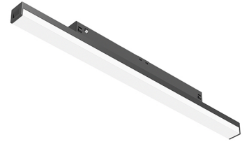
Light Stripe 1500 mm On Board Dimmer designed by FLOS Architectural

Diffused LED light module to be installed in The Tracking Magnet System.