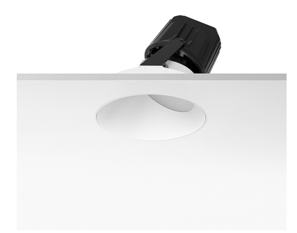
Light Supply Wall-Washer No Trim designed by FLOS Architectural

Embedded luminaire for LED light source. Remote 220/240V power supply included.<nextline>