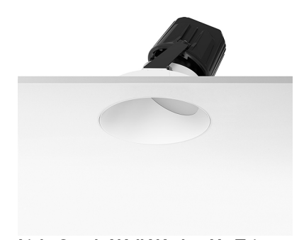
Light Supply Wall-Washer No Trim designed by FLOS Architectural

Recessed luminaire with integrated Phosphor LED light source. Remote 220/240V driver included.