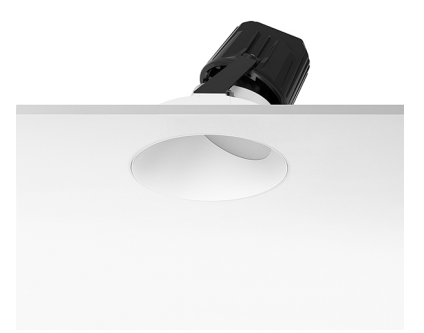
Light Supply Wall-Washer No Trim designed by FLOS Architectural

Recessed luminaire with integrated Phosphor LED light source. Remote 220/240V driver included.