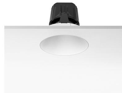
Light Supply Fixed No Trim designed by FLOS Architectural

Recessed luminaire with integrated Phosphor LED light source. Remote 220/240V driver included.