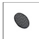
Anti-dazzle louvre M282100