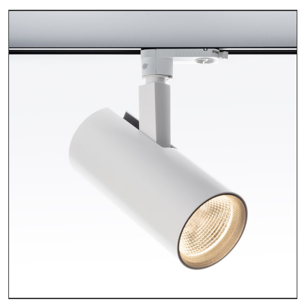
IP 20 ☐ Dimmerable: + ① -