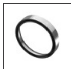
Accessories holder - Vector 95 AP92100