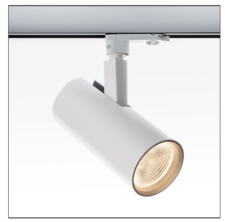
IP 20 ☐ Dimmerable: + ① -