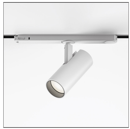
IP 20 □ Dimmerable: + 0 -