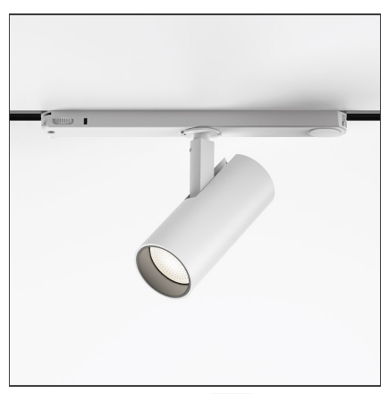
IP 20 ☐ Dimmerable: + ① -