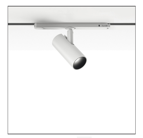
IP 20 ☐ Dimmerable: + ① -