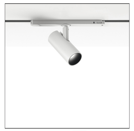
IP 20 ☐ Dimmerable: + ① -