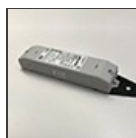
Driver 11-25W 500-700mA - 220- 24Vac - Dimmable DALI - 164x38x24,5 mm (LxWxH) dv1031