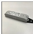
Driver 11-25W 500-700mA - 220- 24Vac - Dimmable DALI - 164x38x24,5 mm (LxWxH) dv1031