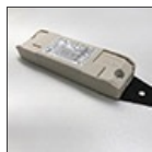
Driver 15-32W 500-700mA - 220- 24Vac - Undimmable - 146,5x43,5x22 mm (LxWxH) dv1030