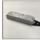
Driver 11-25W 500-700mA - 220- 24Vac - Dimmable DALI - 164x38x24,5 mm (LxWxH) dv1031