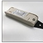
Driver 15-32W 500-700mA - 220- 24Vac - Undimmable - 146,5x43,5x22 mm (LxWxH) dv1030