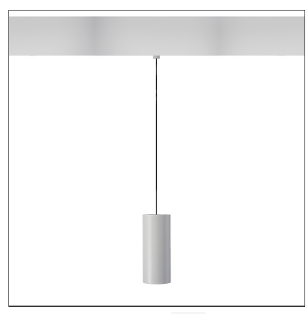
IP 20 Dimmerable: + 10-